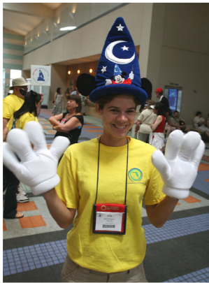
Friendly faces from the Florida Association for Food Protection greeted and directed IAFP 2007 attendees.

Wearing shirts the color of Florida sunshine, the Local Arrangements Committee and their team of friendly volunteers for IAFP 2007 could be spotted just about