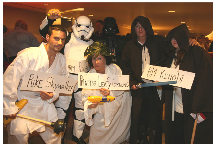
Florida Association for Food Protection appears in a special adaptation of "Star Wars."

Those who attended the July 10 Business Meeting were treated to the Florida Association for Food Protection's always-clever presentation of their annual donation check to the Foundation. In a hilarious parody of the film "Star Wars," our favorite characters reappeared with names and a mission fitting for food safety professionals—and kids. ■