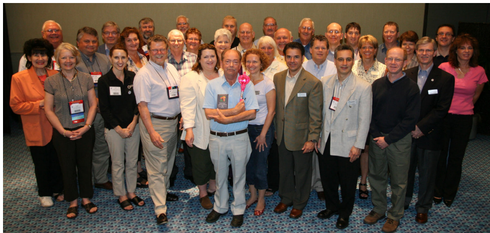
Affiliate Council Meeting, July 2007.